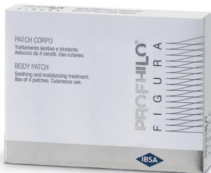
PROFHILO FIGURA BODY PATCH

PROFHILO® BODY contains the same ingredients as PROFHILO® in a bigger 3ml syringe for in-clinic treatment. The full treatment course consist of 2 syringes of PROFHILO® BODY, 2 Body patches, and a home-care body cream.